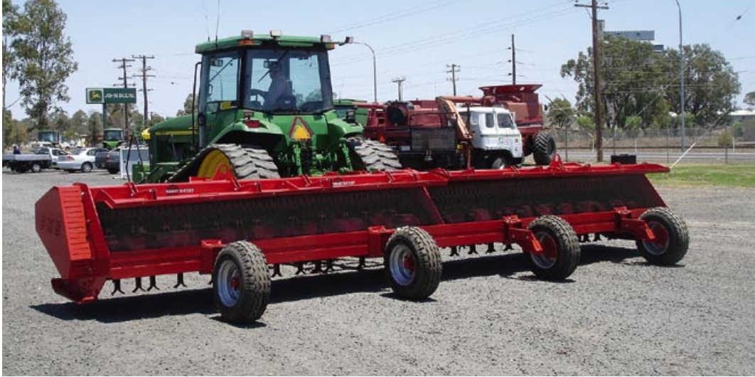
Easy access for service and cleaning