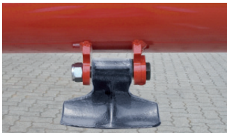
Heavy hammer flails for optimal shredding of thicker prunings