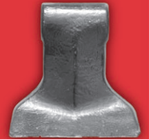
Wide flail -> WM