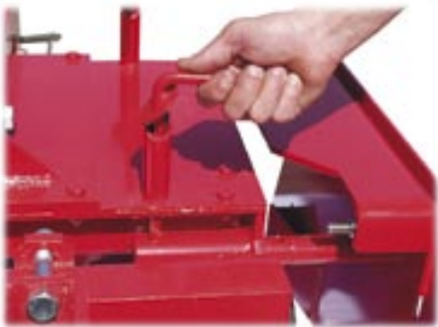
Simple adjustment without tools